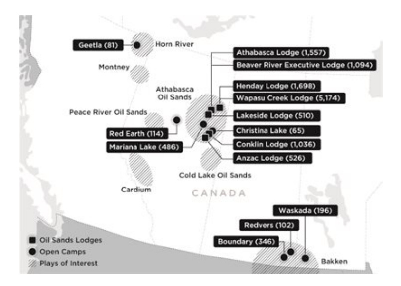
Rooms in our Canadian Lodges