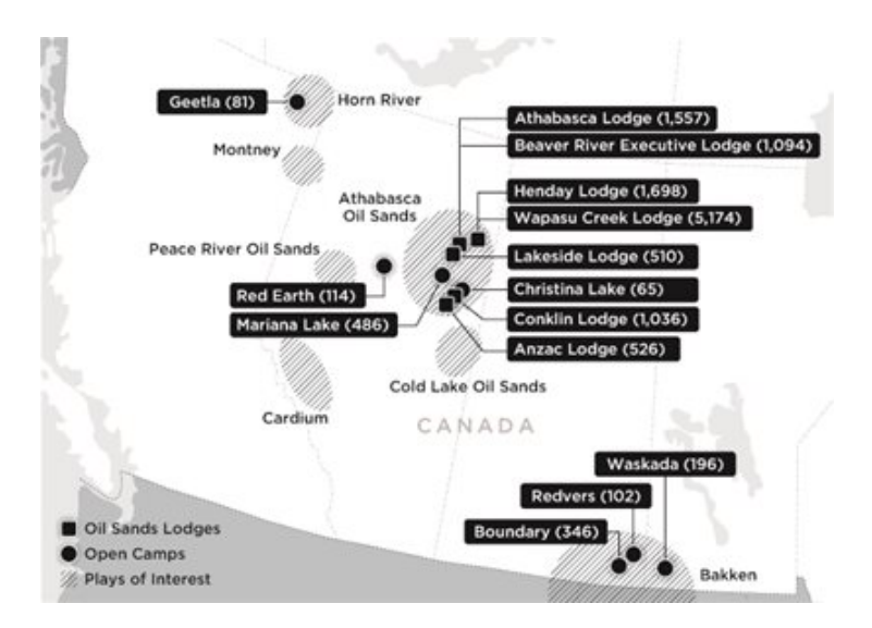
Rooms in our Canadian Lodges